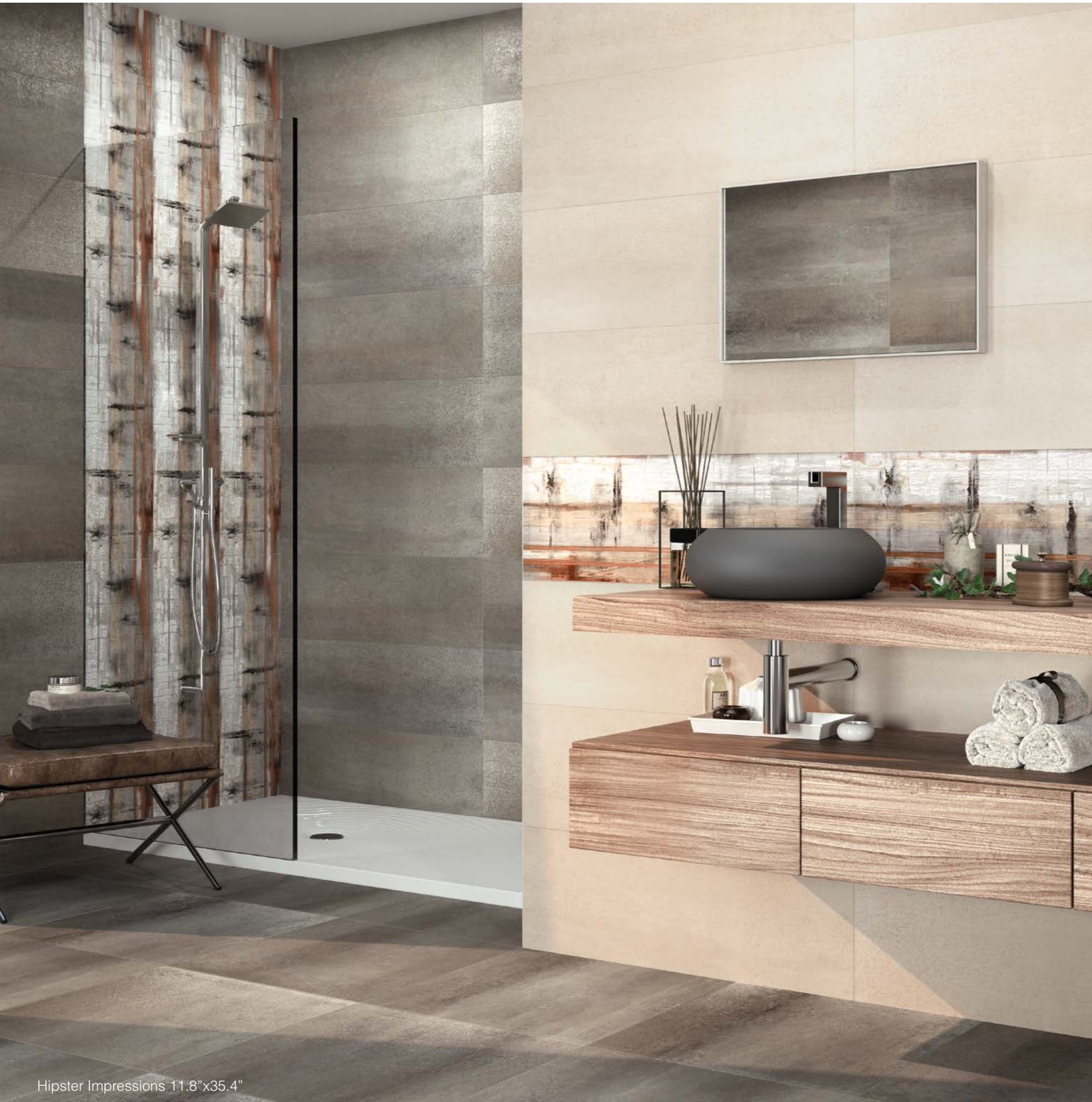
Hipster Impressions 11.8"x35.4"

Hipster, a collection with a strong industrial influence, where concrete and metal take center stage. Created to recreate the feel of industrial areas, with the warmth and smoothness of ceramics.